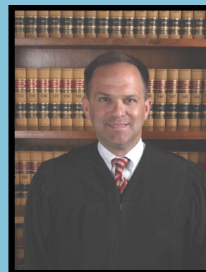
Speaker: Honorable Salvatore Sirna Asst. Supervising Judge Los Angeles (Pomona) Superior Court

The What, When, How and Where of the New Electronic Court Filing System